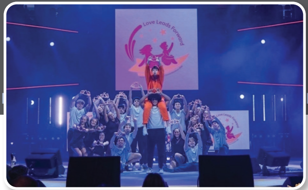
DU paired with Alpha Xi Delta for Greek Sing, dancing on stage to a remix of songs from the soundtrack of The Lorax.